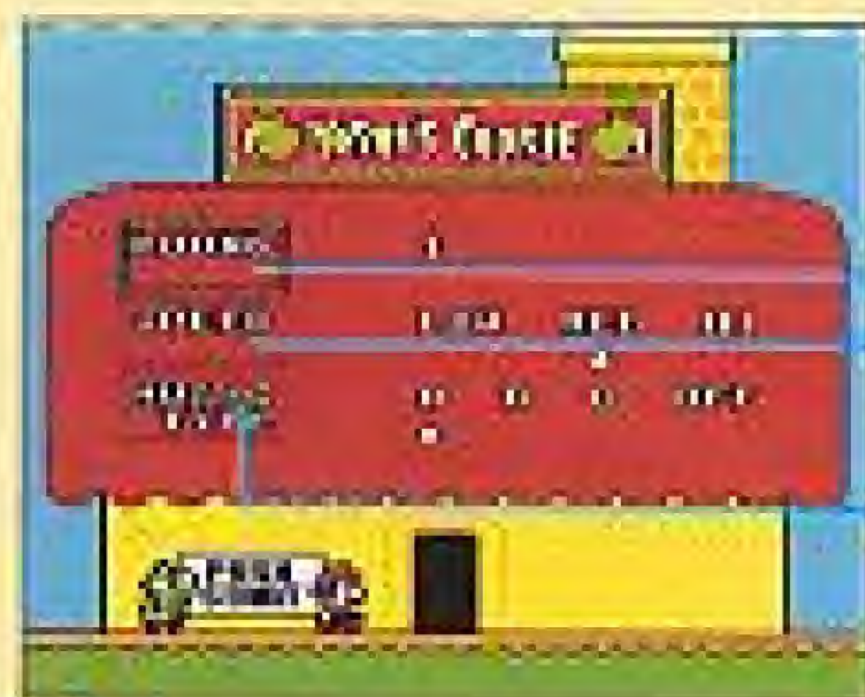
Round Speed Music Type